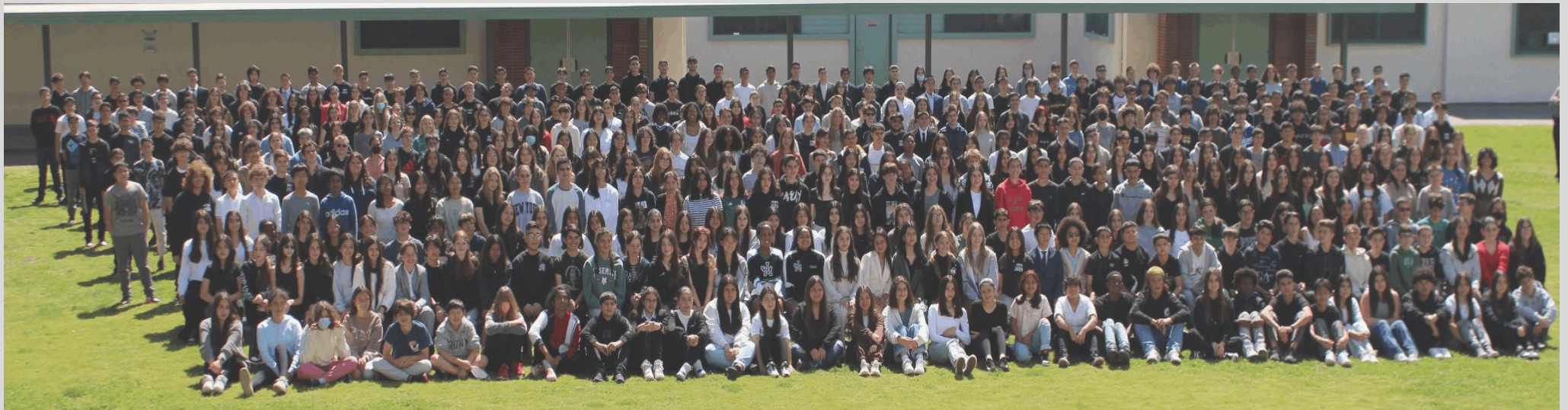
8th Grade Panoramic Picture, April 19, 2023

Welcome to the inaugural issue of the Highlander: Yearbook magazine! This will be a place for stories that happened after our yearbook deadline passed, but were still happening on campus. We hope you enjoy!